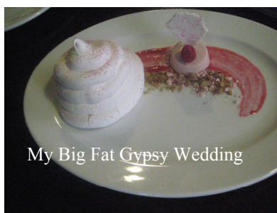
My Big Fat Gypsy Wedding